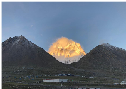
KAILASH MANASAROVAR BY OVERLAND 14 Days / 13 Nights