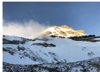
KAILASH MANASAROVAR BY LHASA 15 Days / 14 Nights